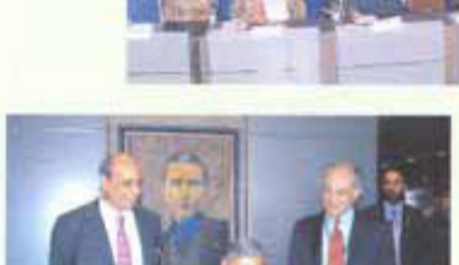
▲ Prime Minister Shaukat Aziz signing the visitors' book.