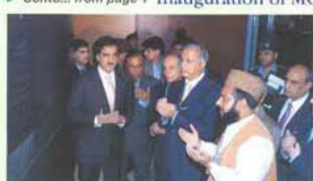
▲ Prime Minister Shaukat Aziz offering dua along with other dignitaries in front of the inauguration plaque.

He said the building was clearly a historic project for Pakistan and an icon of growth and development in the country. Talking of rising prices of real estate especially commercial land, he suggested that builders should go vertical for office and residential blocks to justify the investment in the land.