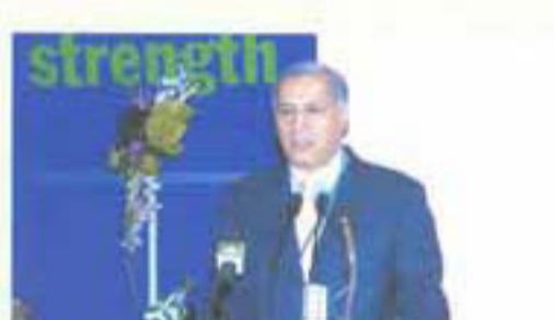
▲ Prime Minister Shaukat Aziz delivering his speech.