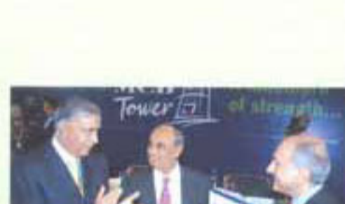
▲ Prime Minister Shaukat Aziz being presented memento of his visit.