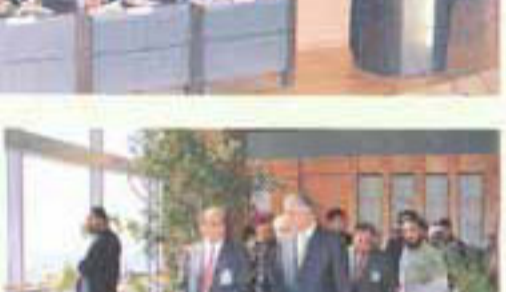
▲ Prime Minister Shaukat Aziz visiting the corporate floor of the MCB Tower along with other distinguished guests.